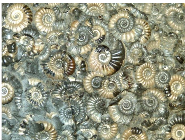
Promicroceras detail (NHMUK PI C 2138)